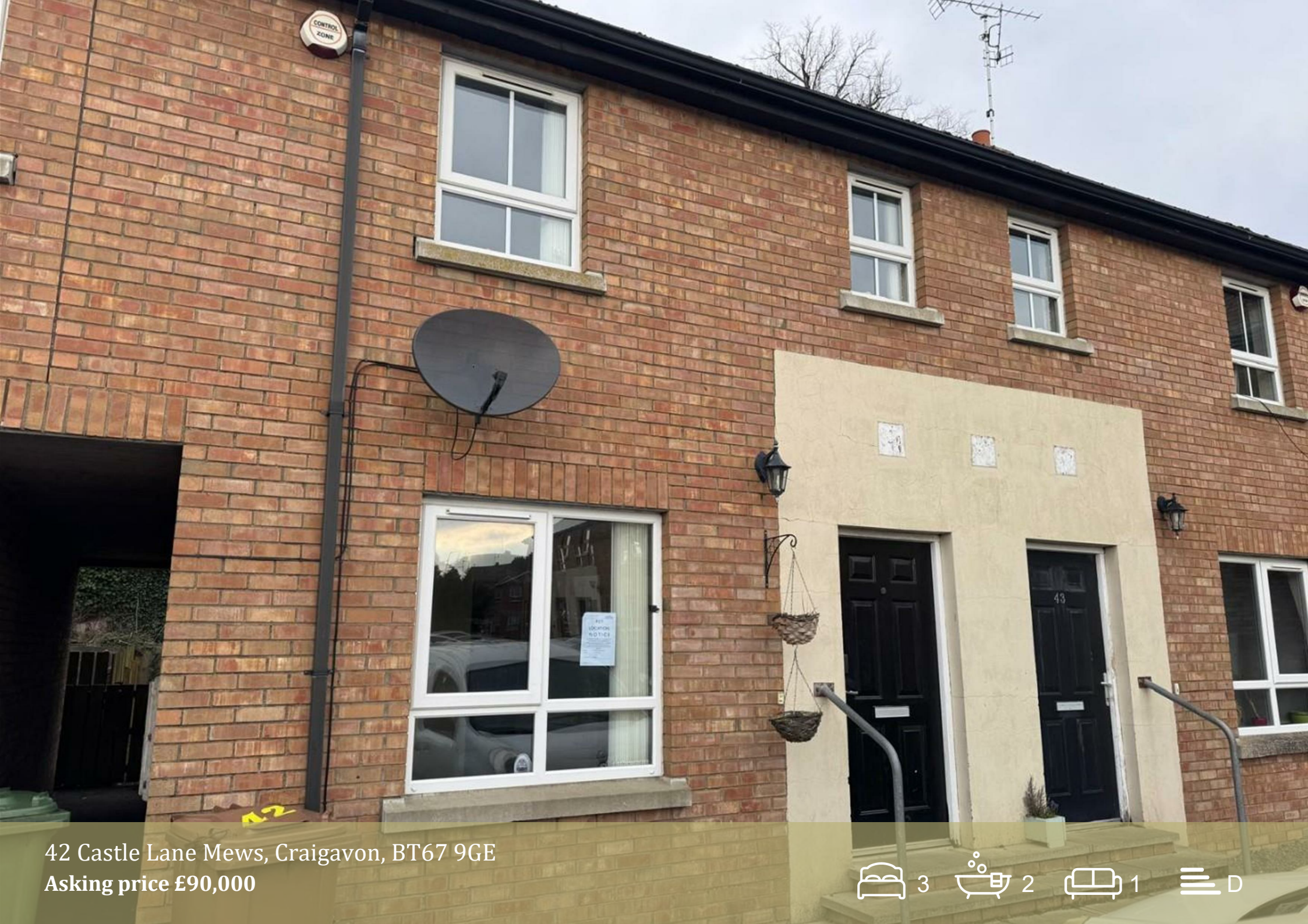
42 Castle Lane Mews, Craigavon, BT67 9GE Asking price £90,000