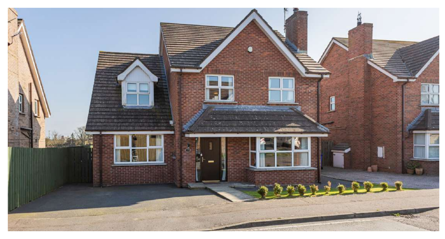
DETACHED | 5 ⊨ | 2 ≒ | 3 ⊟

Occupying arguably one of the finest sites in this popular residential area here is an outstanding opportunity to purchase an exceptional detached family home with southerly aspect to the rear and also backing onto open countryside.