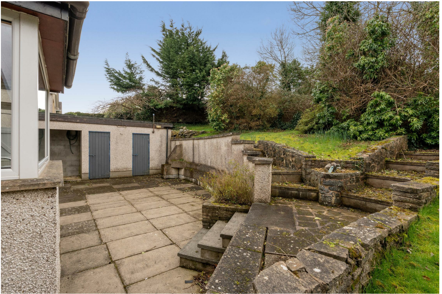
Approx. 105.2 sq. metres (1132.5 sq. feet)