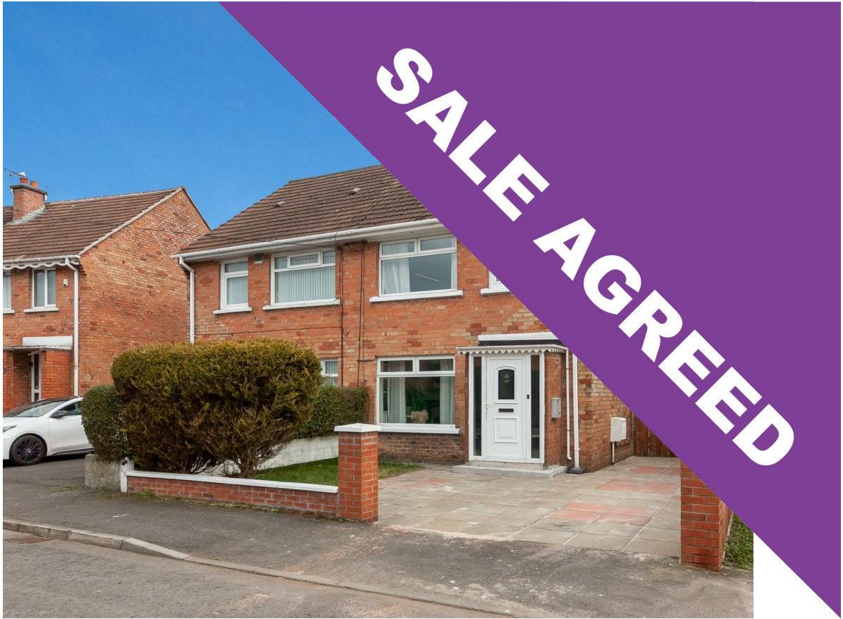
23 Harmin Crescent, Newtownabbey, BT36 7UP