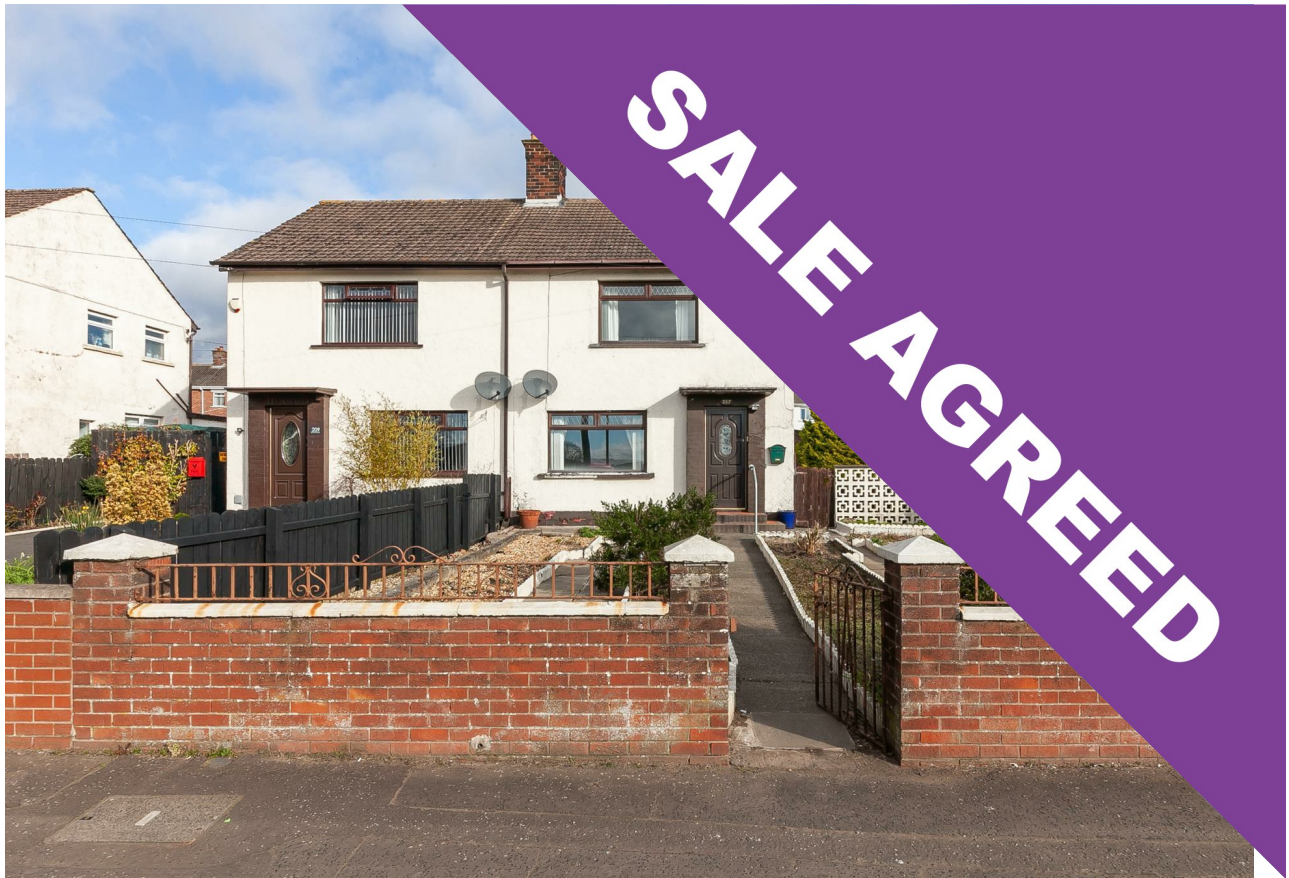
207 Jordanstown Road, Newtownabbey, BT37 0LX