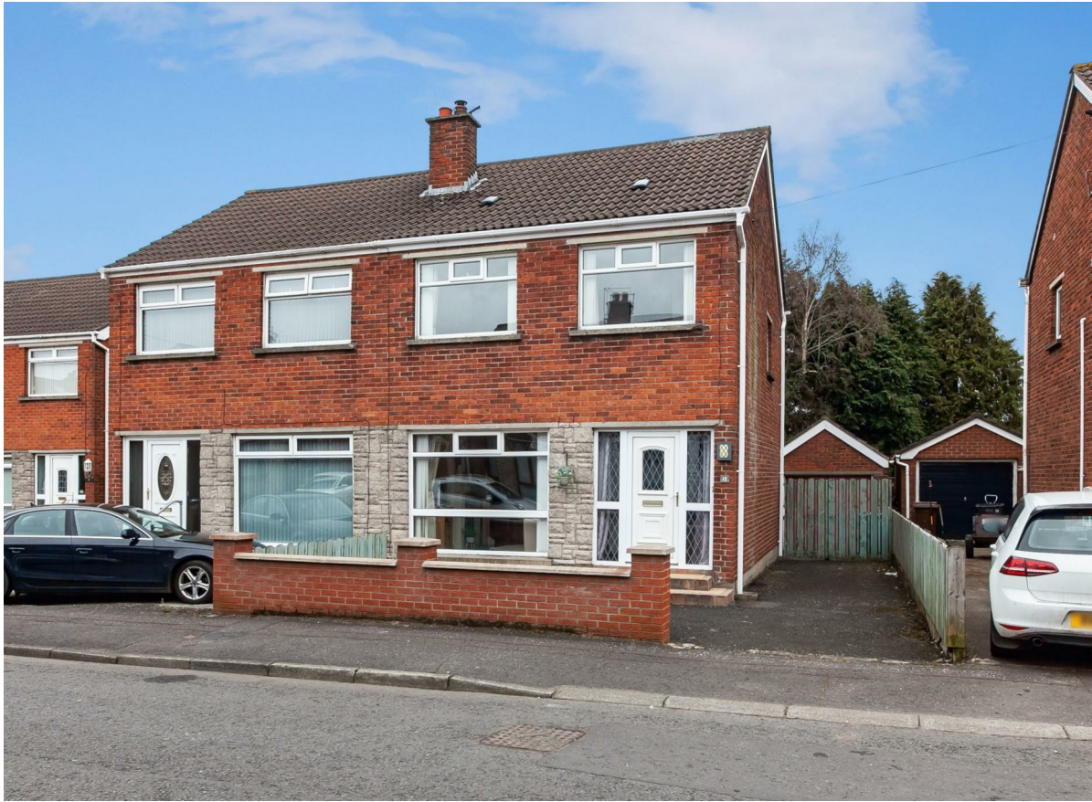
12 Sandyknowes Crescent, Newtownabbey, BT36 5DJ