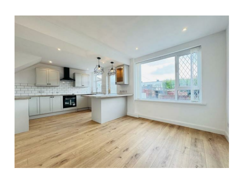
79 Princes Crescent Whiteabbey, Newtownabbey, BT37 0BA