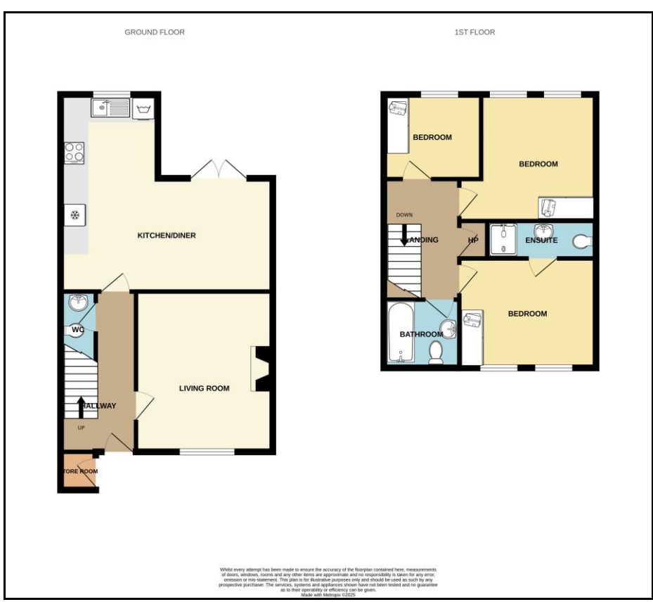
For illustrative purposes only. Not to scale