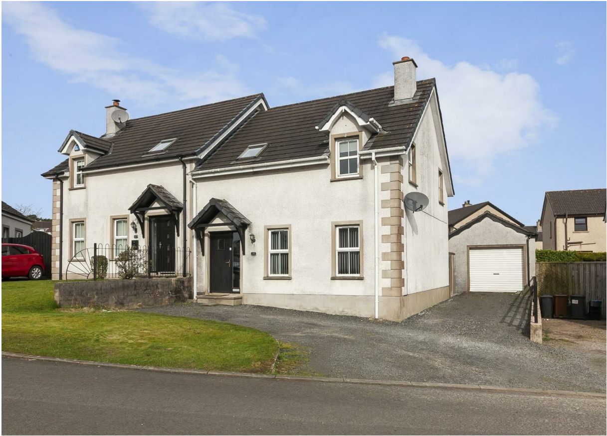
15 Douglas Avenue, Doagh, Ballyclare, BT39 0UA