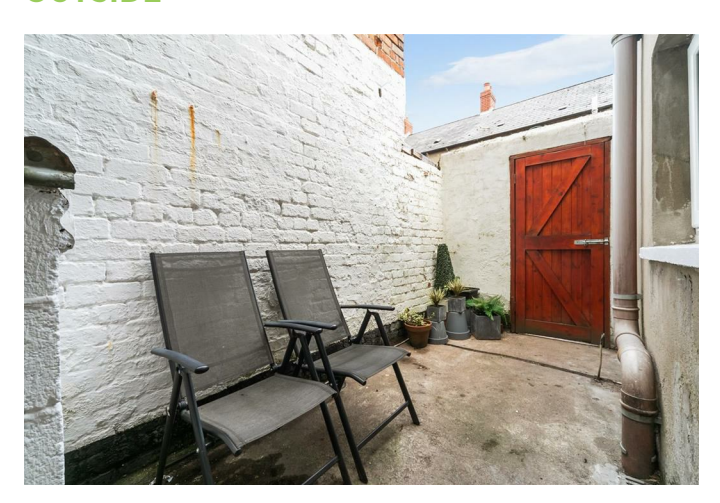
Enclosed yard to rear.