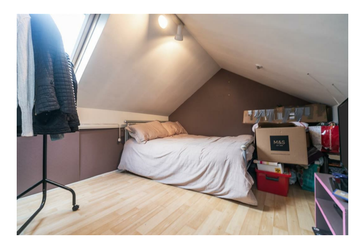
Laminate flooring and storage in eaves.