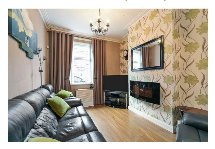
Electric fire. Laminate flooring. Under stairs storage.