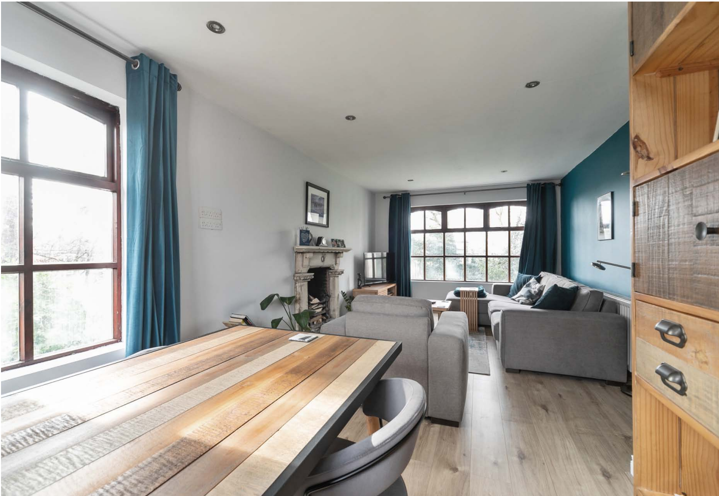
Living room opening to dining area