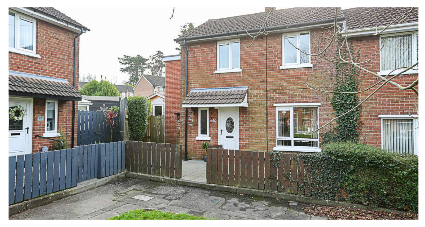
END TERRACE | 3 ⊨ | 1 ≒ | 2 ⊟

20 Knocknagoney Drive is a beautifully extended and well-presented three-bedroom end-terrace home, offering spacious and modern living in a highly convenient location.