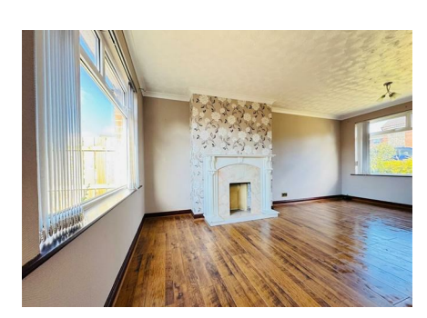
55 Burnthill Crescent Ballyclare Road, Newtownabbey, BT36 5AE