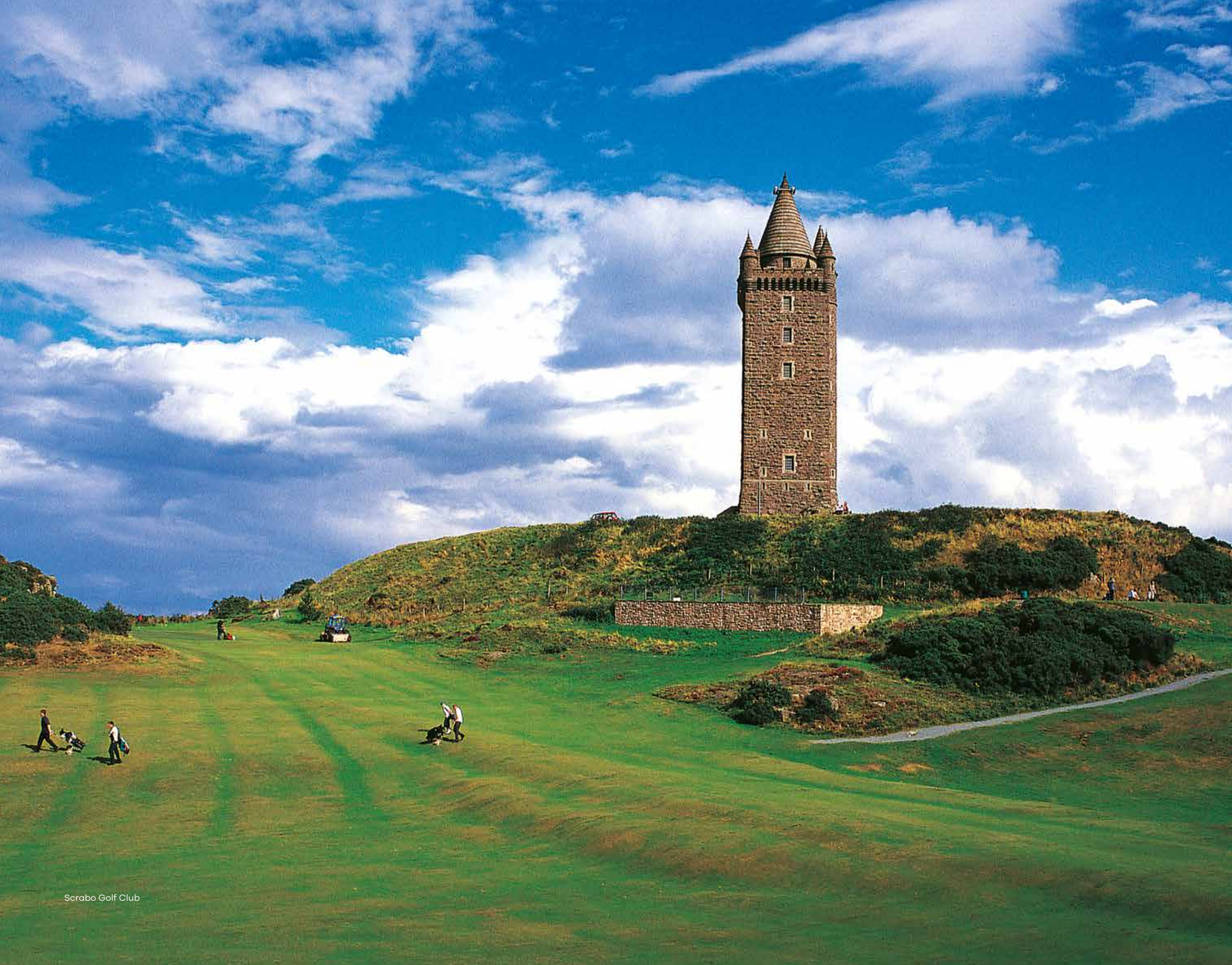
Scrabo Golf Club