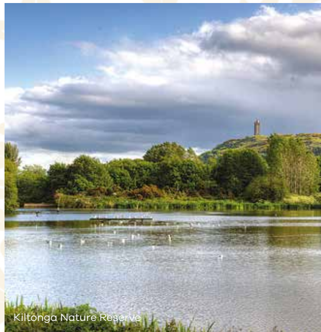
Kiltonga Nature Reserve

Educational facilities are in abundance, with many of North Down's leading primary, secondary and grammar schools located in the town.