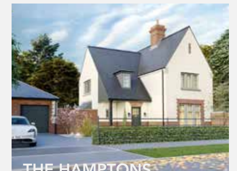
THE HAMPTONS Belfast

Built in the right place, in the right way, in the right style, by the right people.