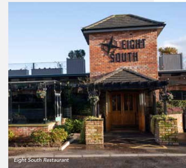
Eight South Restaurant