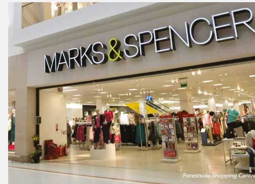
Forests Shopping Centre