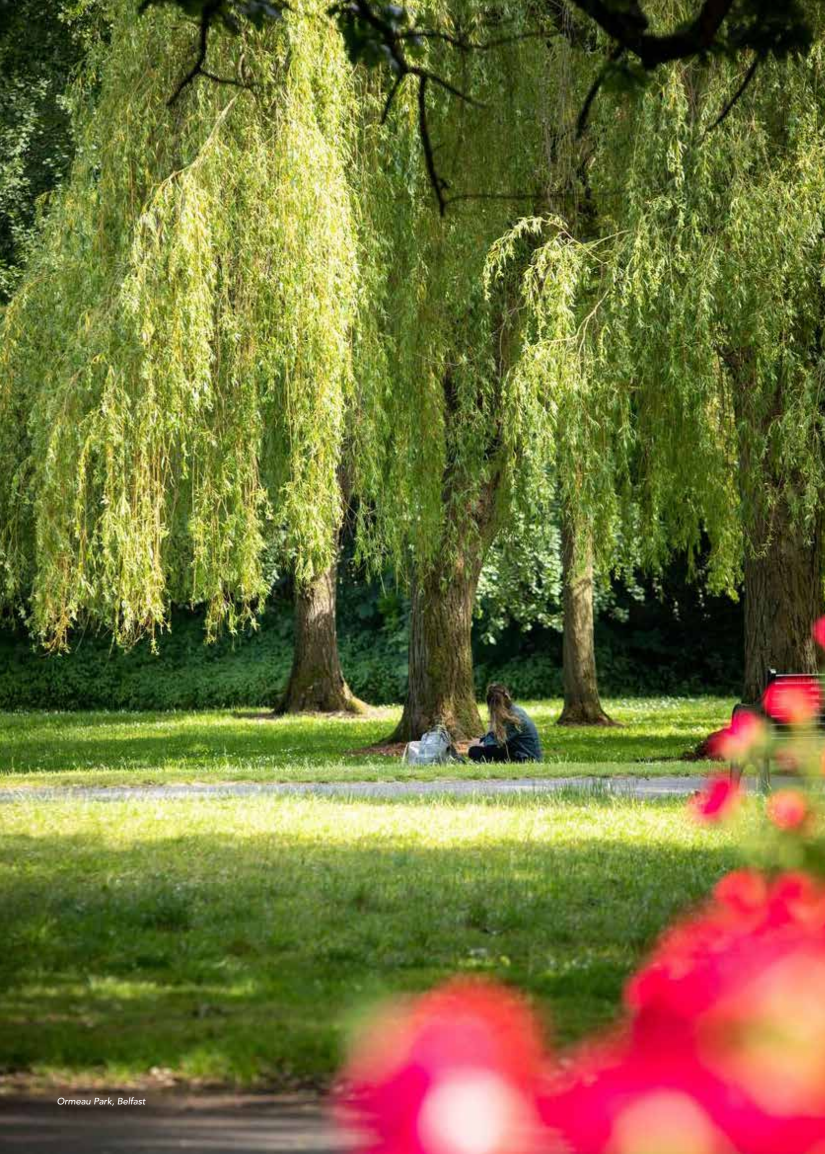
Ormeau Park, Belfast