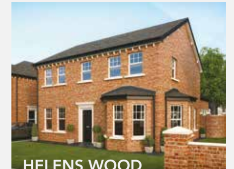
HELENS WOOD Bangor