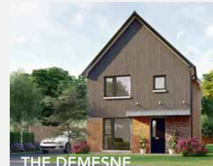
THE DEMESNE Woodbrook, Lisburn