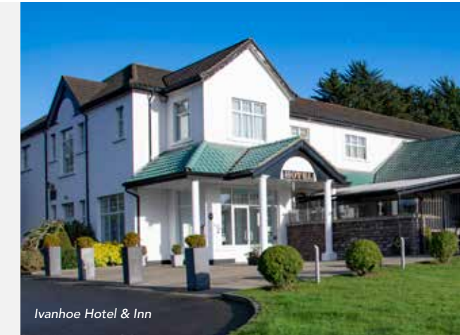
Ivanhoe Hotel & Inn