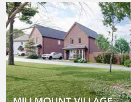
MILLMOUNT VILLAGE Dundonald