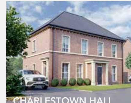
CHARLESTOWN HALL Lisburn