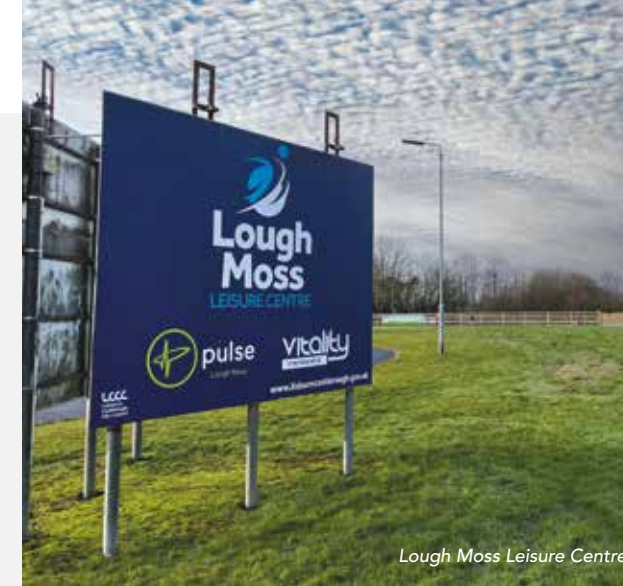
Lough Moss Leisure Centre