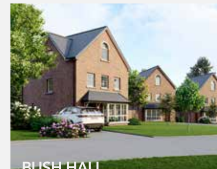
BUSH HALL Antrim