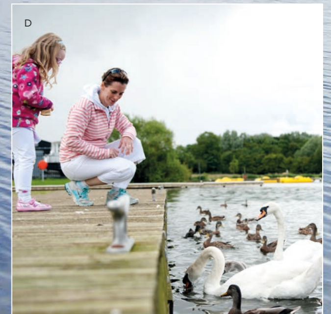
A | Ardross House Gardens B | Newforge House, Restaurant C | Newforge House D | Lough Neagh Discovery Centre