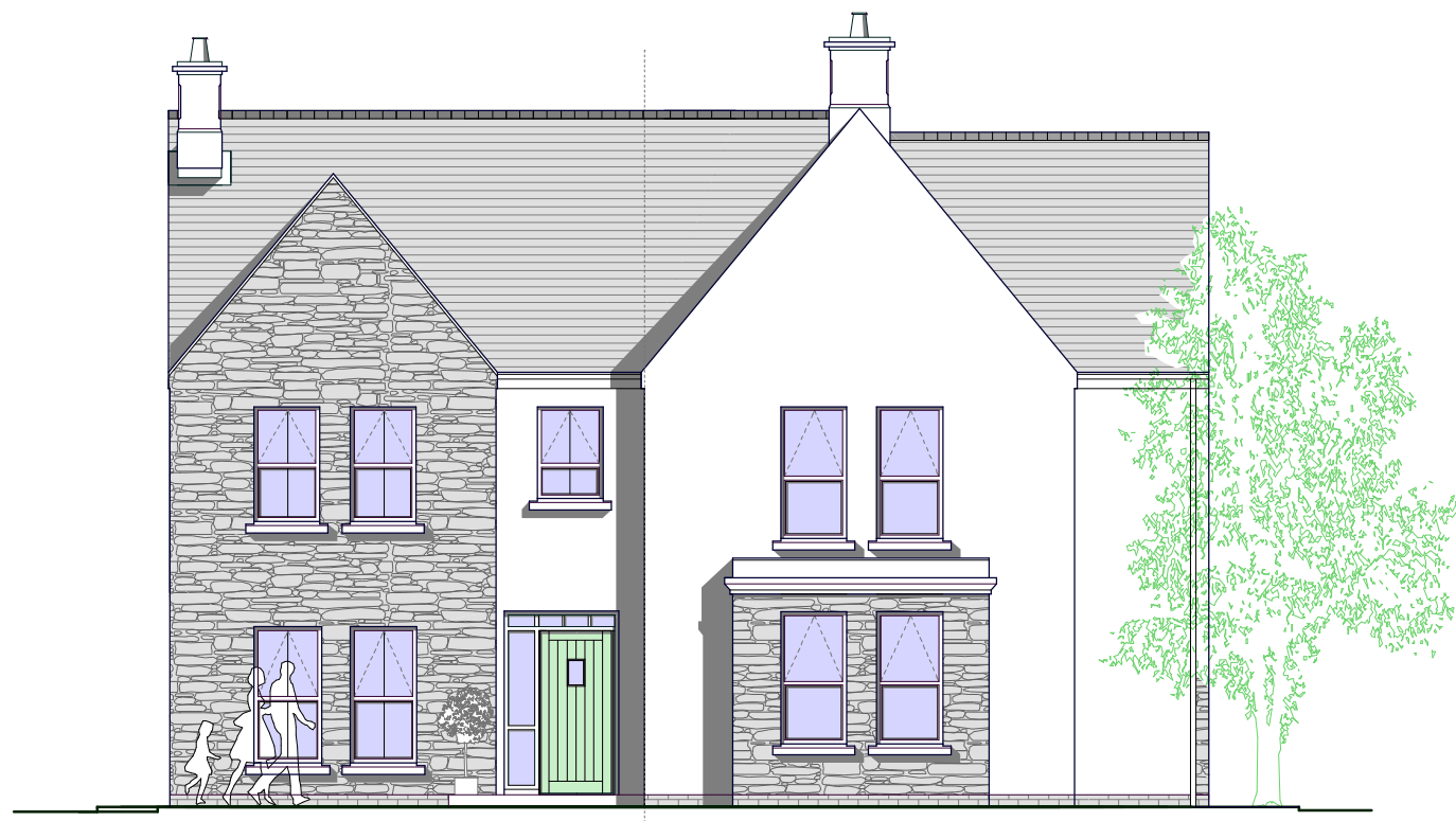
PROPOSED FRONT ELEVATION PROPOSED FRONT ELEVATION