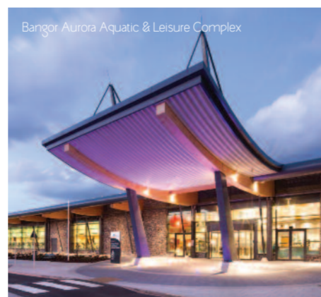
Bangor Aurora Aquatic & Leisure Complex