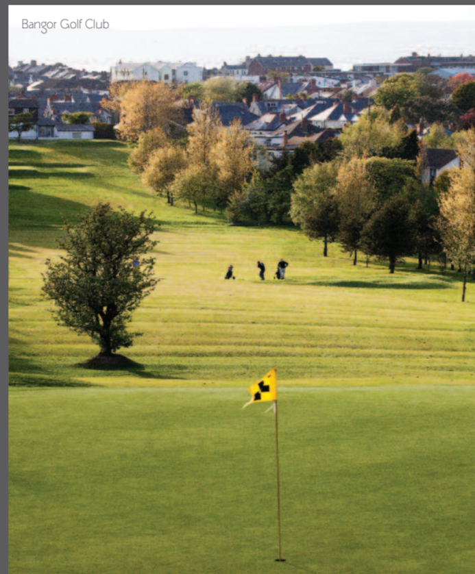
Bangor Golf Club