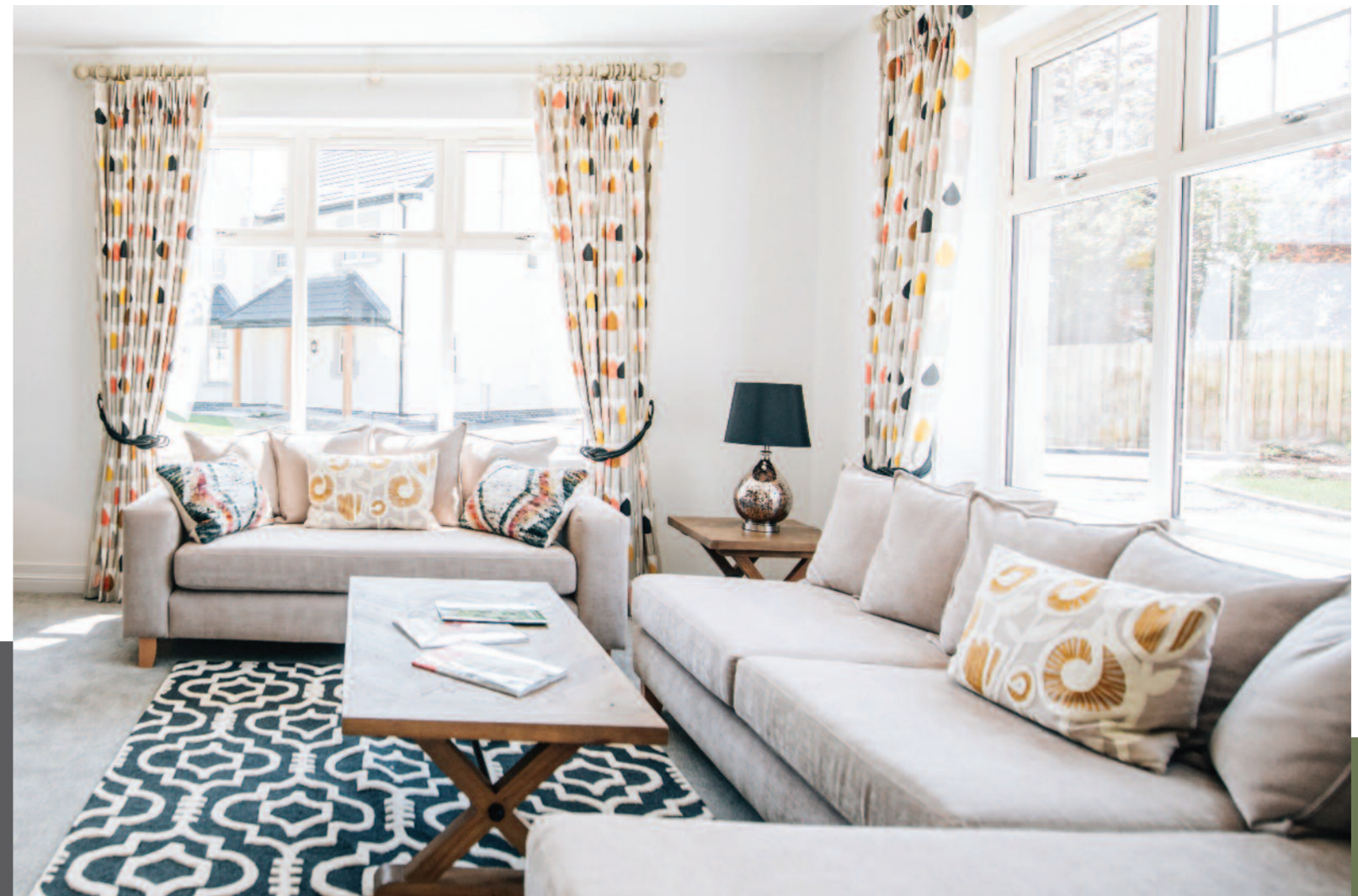
Interior images reflect the style of finish at Helens Wood.