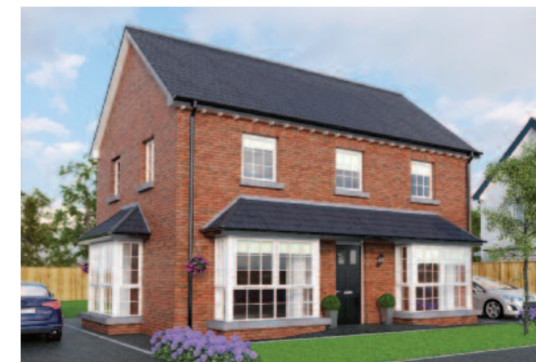
MAGHERALAVE MEADOWS Lisburn