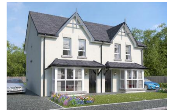
MILLMOUNT VILLAGE Dundonald

Built in the right place, in the right way, in the right style, by the right people.