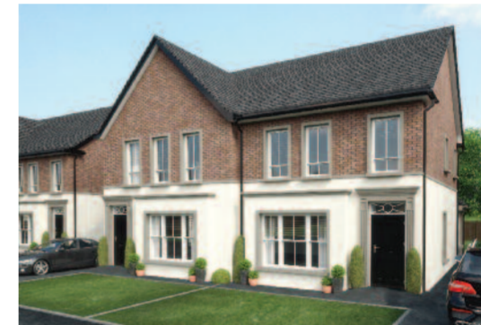
LYNN HALL PARK Bangor