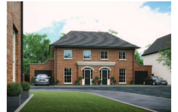
ST INNS Moira