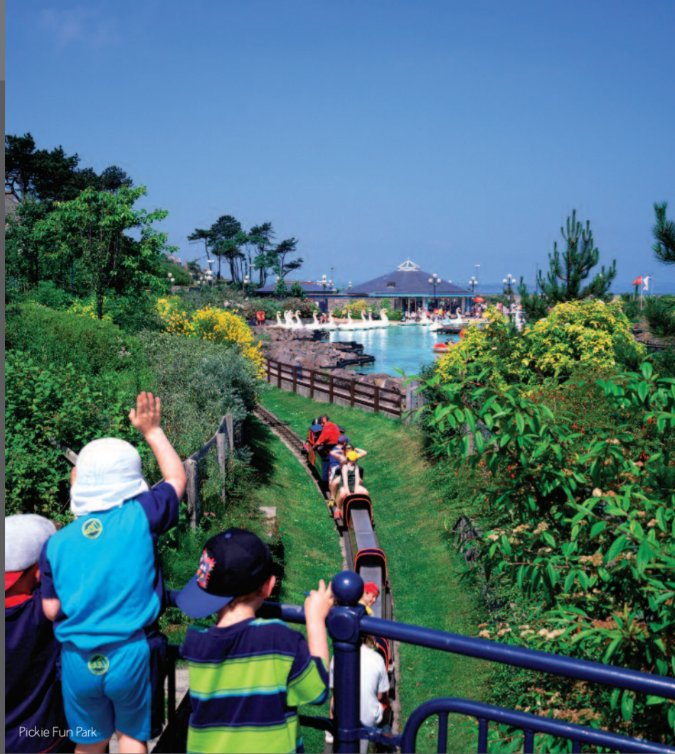
Pickle Fun Park