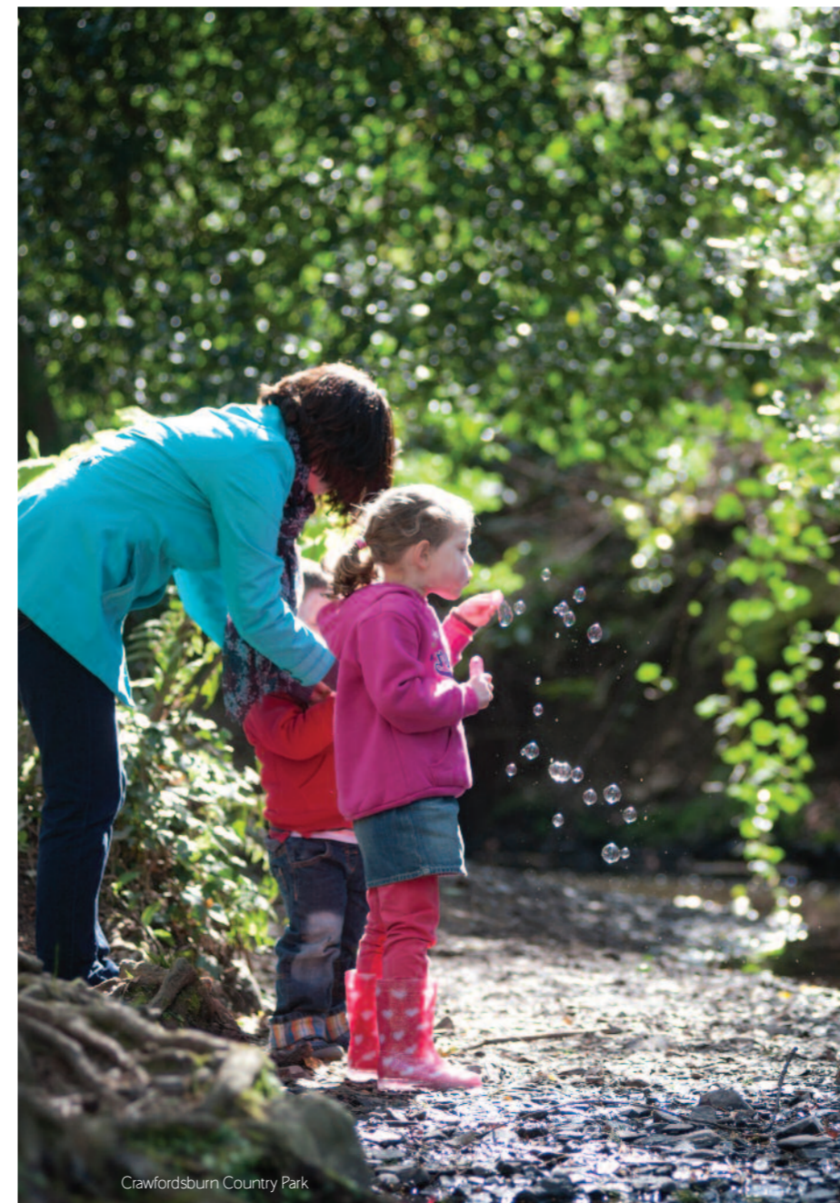
Crawfordsburn Country Park