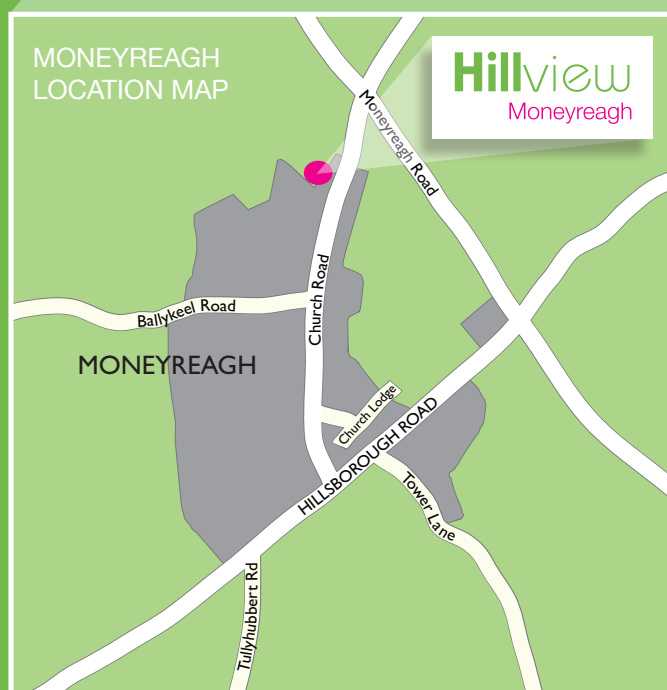
MONEYREAGH LOCATION MAP