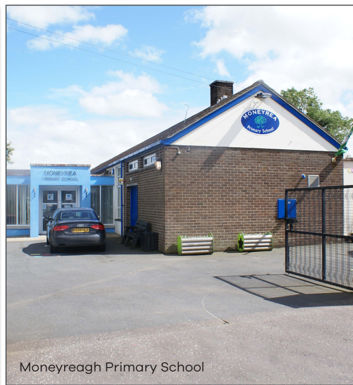
Moneyreagh Primary School